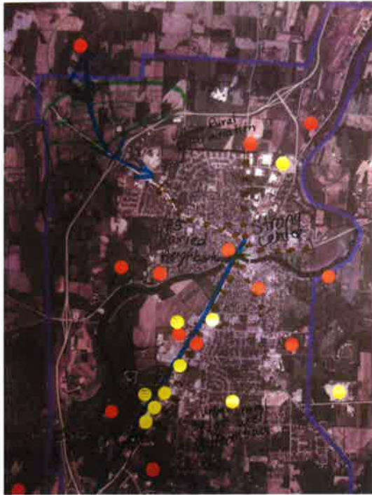
Output board mapped by workshop participants using the key provided.