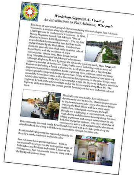
"Your Town" narrative for Fort Atkinson, Wisconsin. Narratives consist of introductory and key background descriptors about the community.