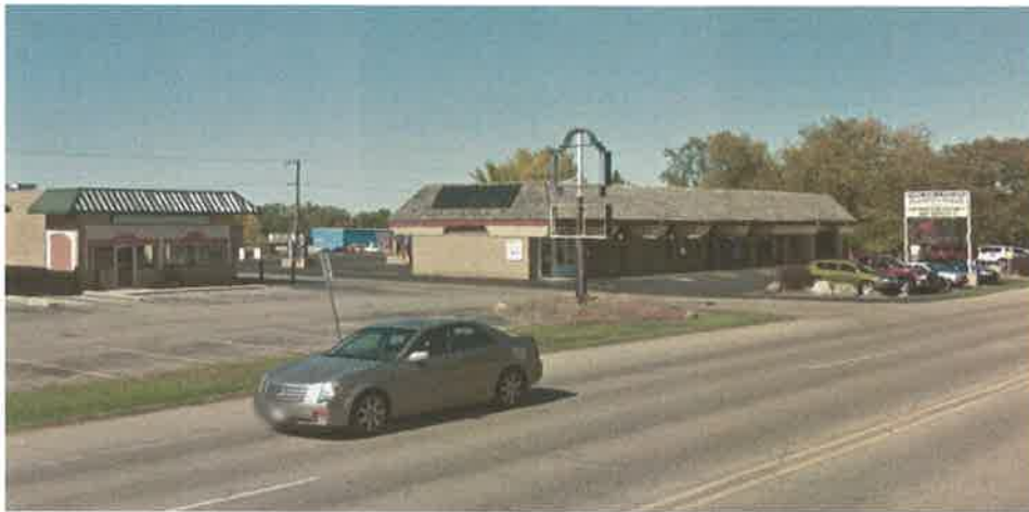
Figure 1: Existing, former Taco Johns Sign

The subway on Janesville Ave is moving to occupy the former Taco Johns building. The former sign will be replaced with a new Subway sign as shown at right.